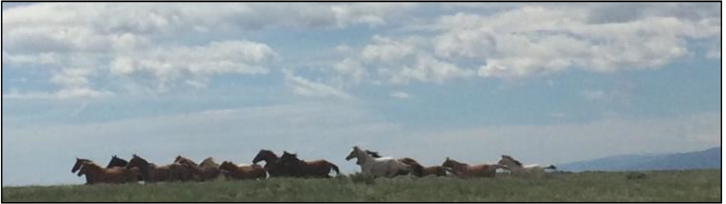
The wild horses in Dubois, Wyoming. June 2017