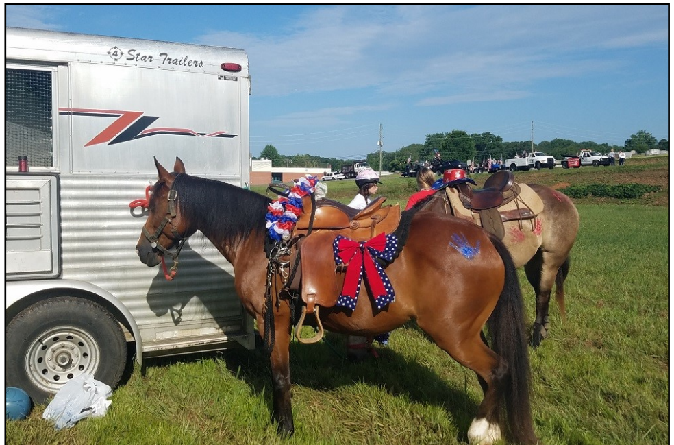
All decked out in red, white and blue!