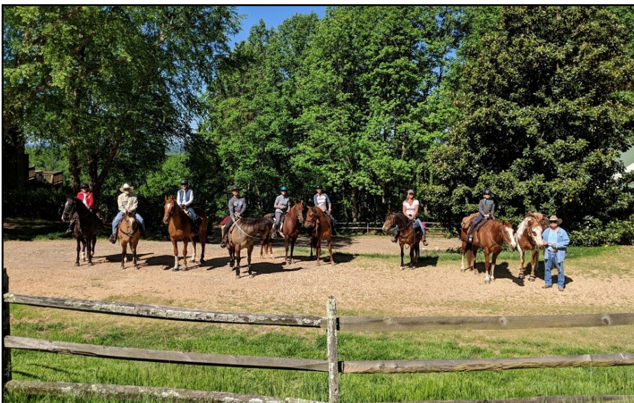
Top of World ride at North Wind Farm