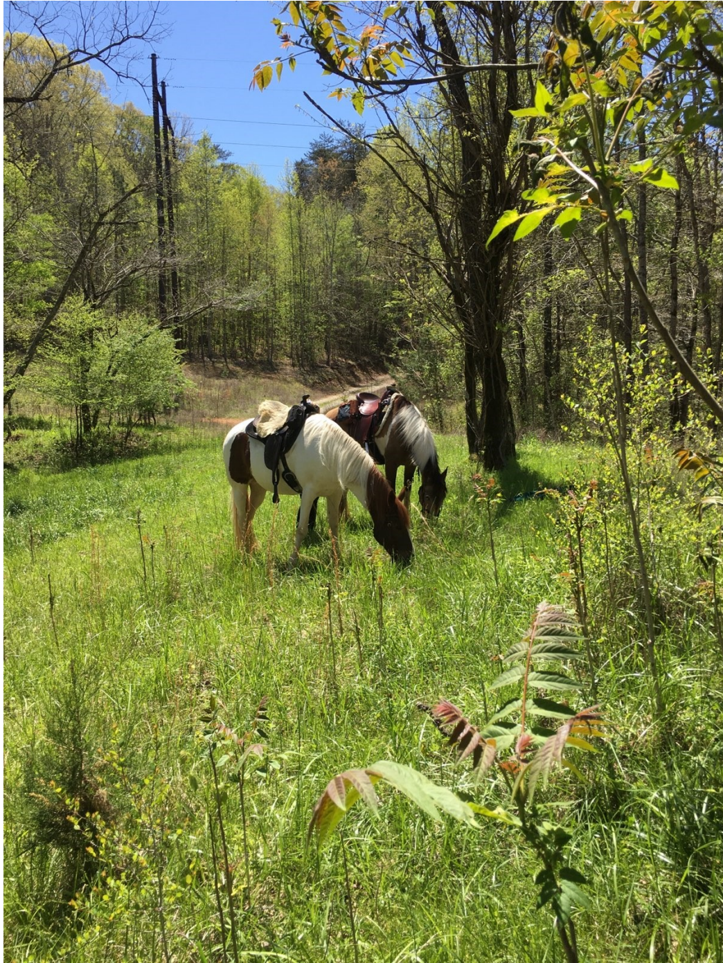
Cheyenne (Hartin )and Blue (Hunter) at Dawson Forest.