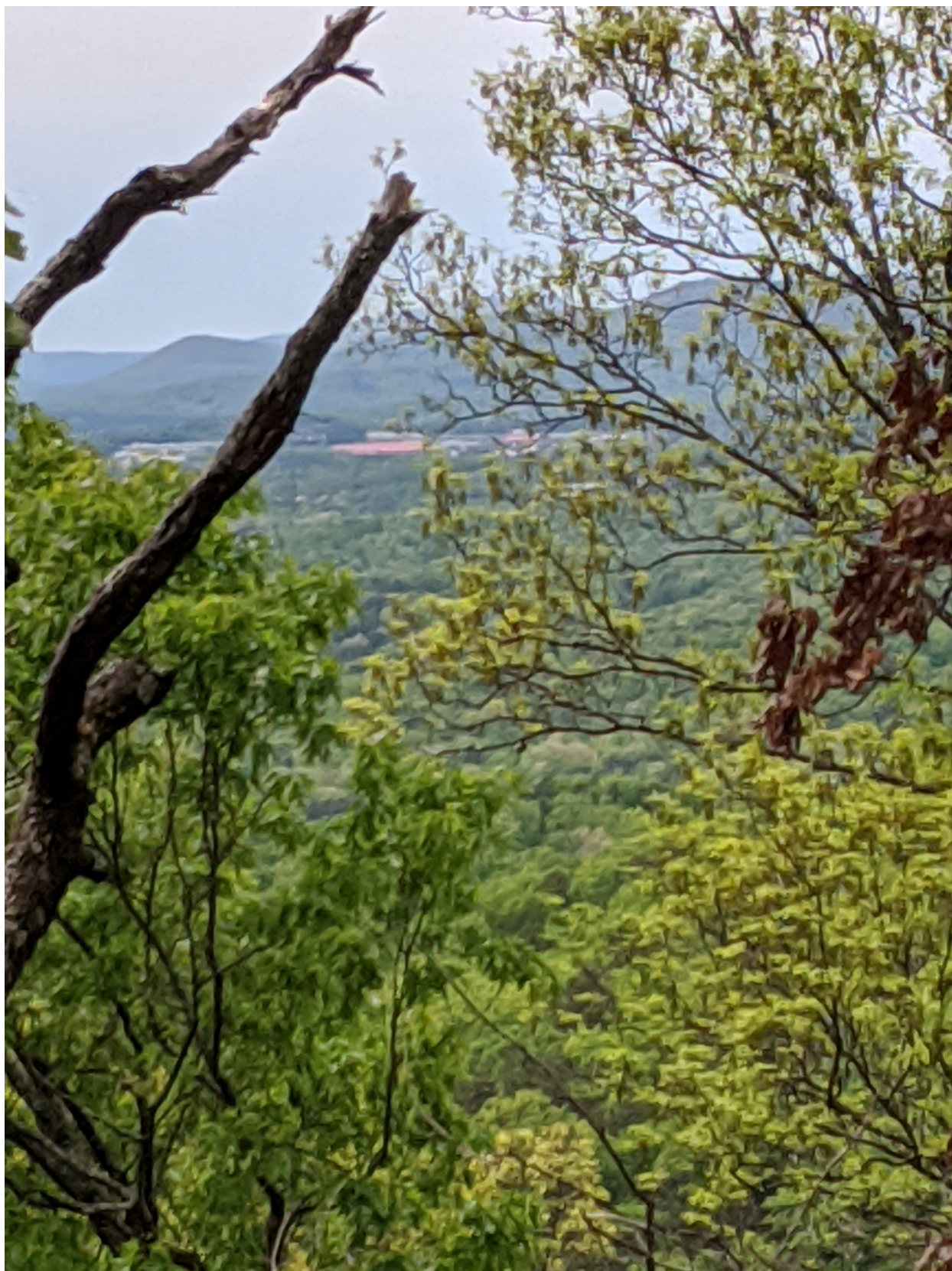
That's the red roof of the Bargain Barn across the valley.