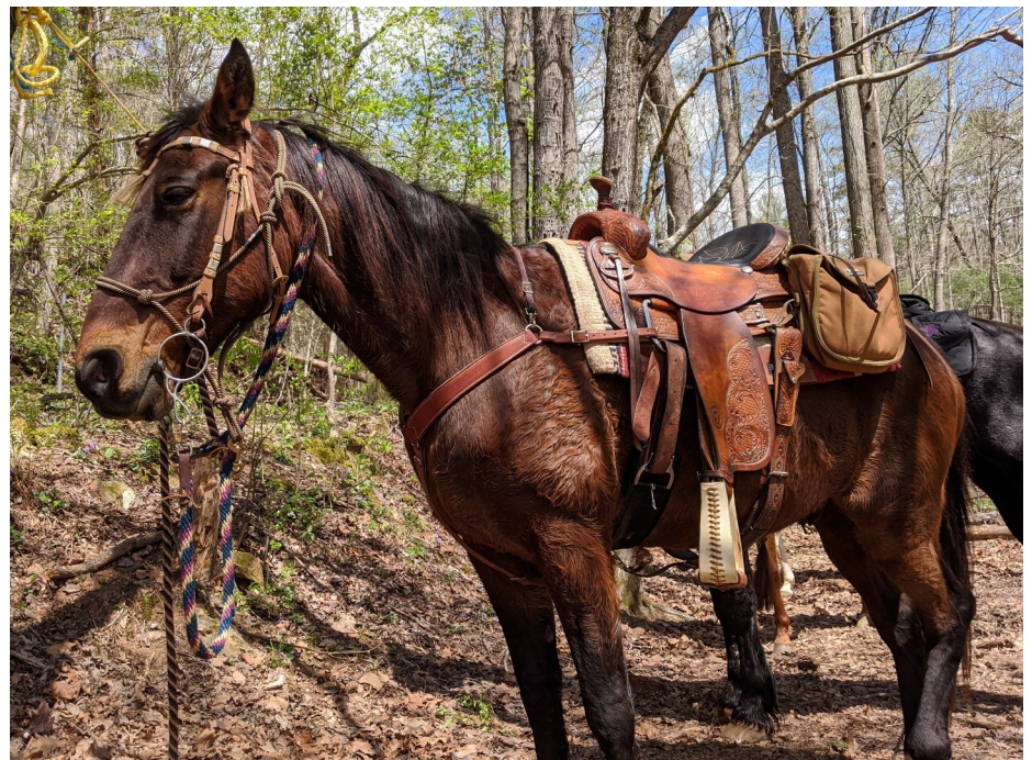
Ranger taking a snooze.