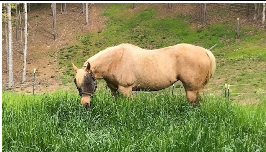
If you decide to stay at home, then at least get the grass mowed. That's TJ (Williams).