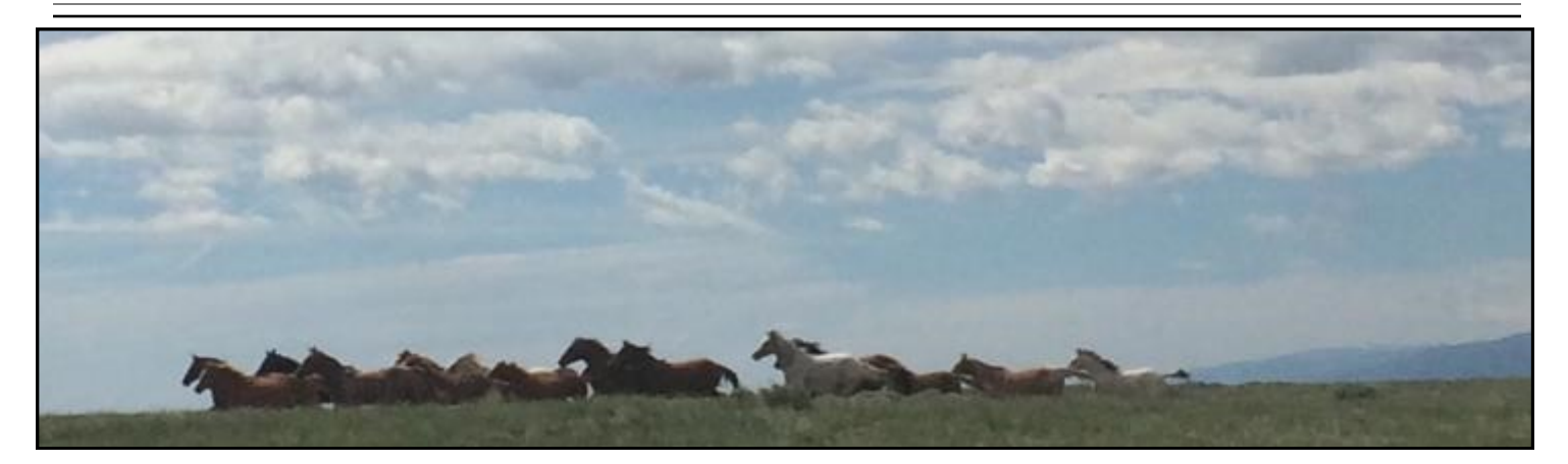
The wild horses in Dubois, Wyoming. June 2017