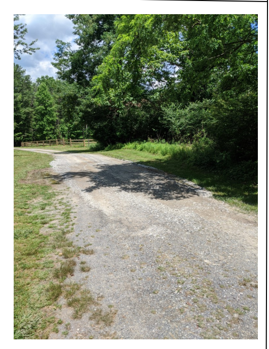
The giant pothole is fixed!