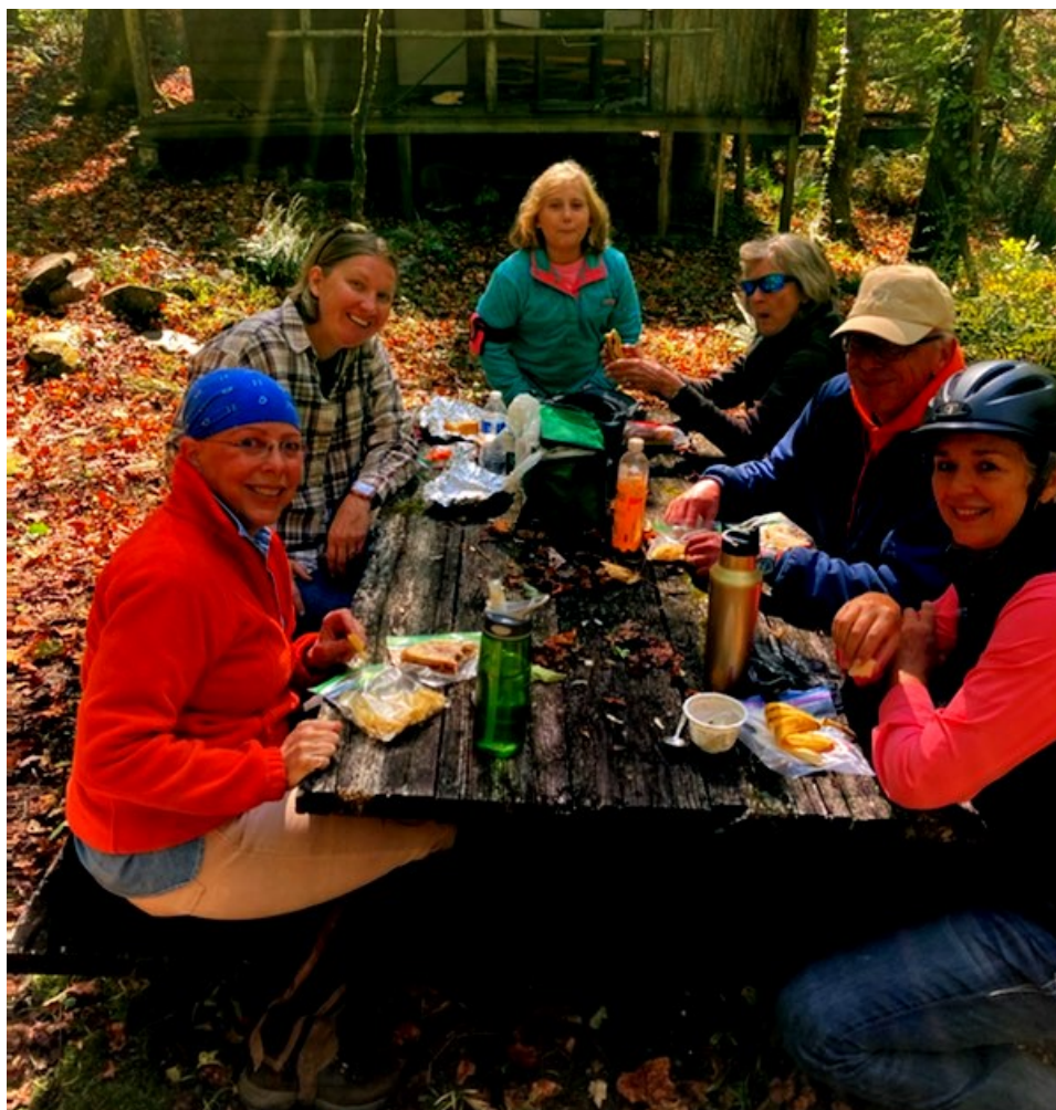
Lunch was a casual affair. Actually, this was a bit upscale for us. We had a table.