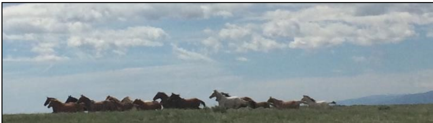
The wild horses in Dubois, Wyoming. June 2017