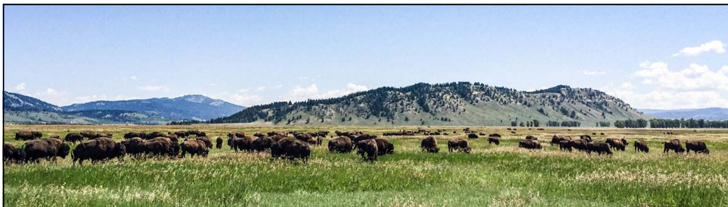
Herd of Buffalos in Montana 2020