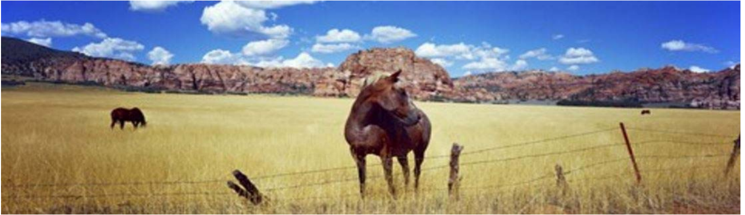
Kolob Reservoir Utah