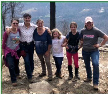
“The Gang on Top of Sharptop”