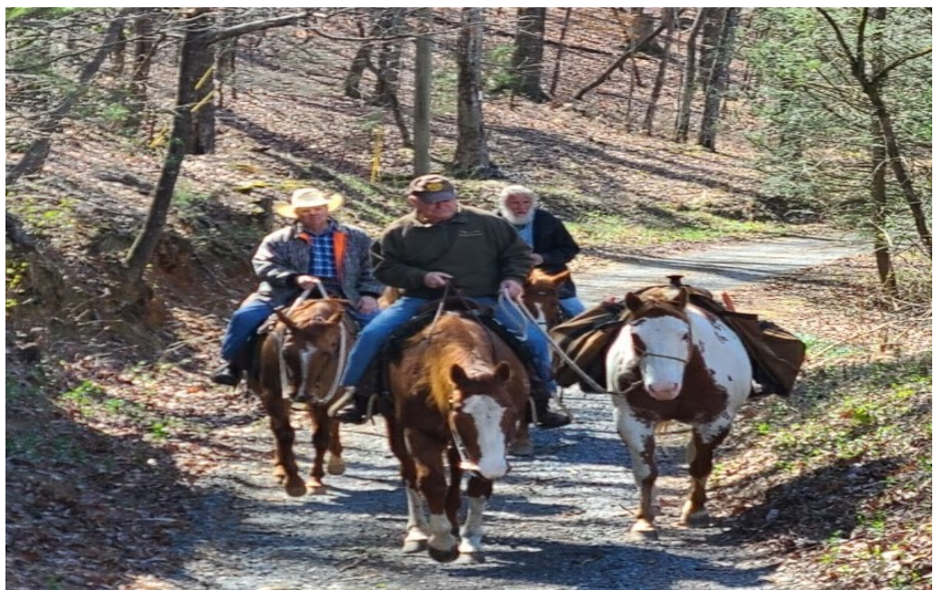
Don't let the above fool you. These people were there just for the picture taking.