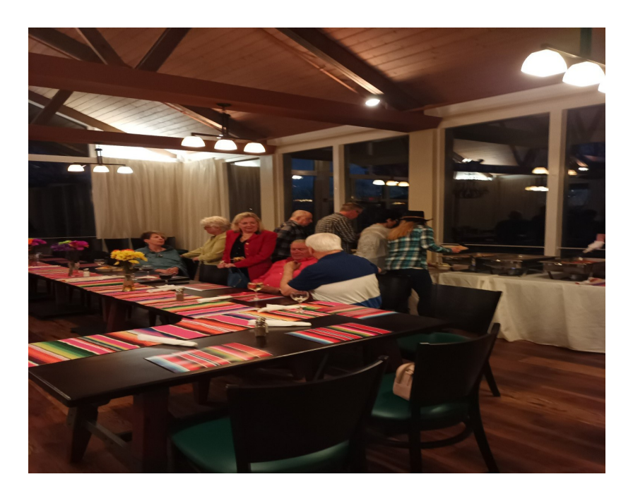
A GREAT TIME TO RECONNECT!