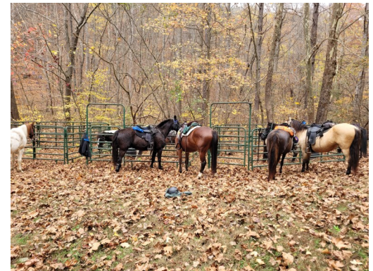
Planning to host Garland Mountain trail riders, Ellen and Bill Stara placed these corrals on their property.