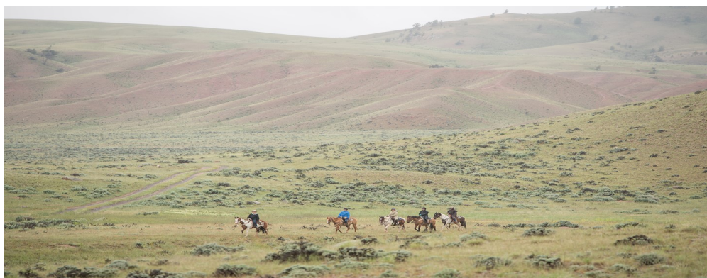
2017 Lazy L & B Ranch Dubois, WY