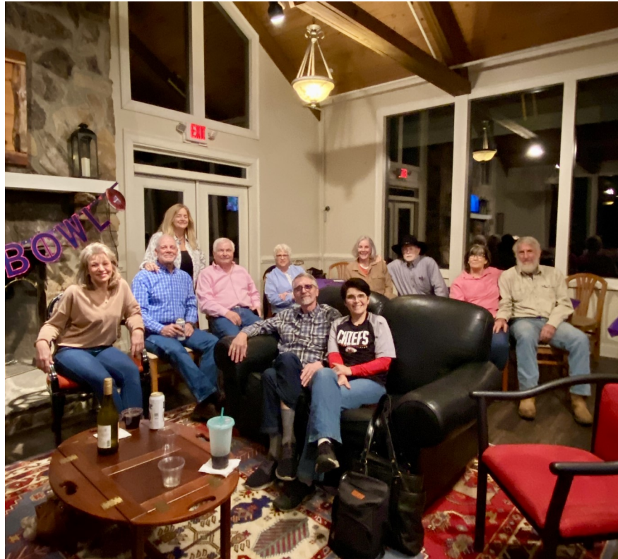
As we all know, there are some people who will never leave. Here are the people who stuck it out at the Super Bowl Party until the Chiefs won in overtime. Half of them didn't even know who was playing!