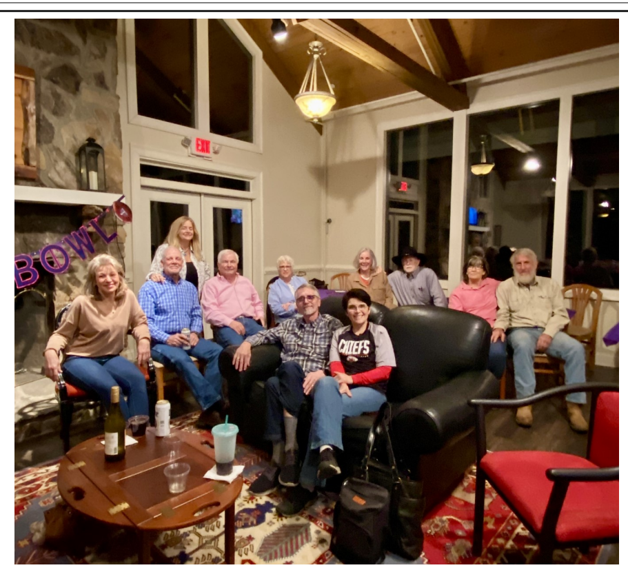
As we all know, there are some people who will never leave. Here are the people who stuck it out at the Super Bowl Party until the Chiefs won in overtime. Half of them didn't even know who was playing!