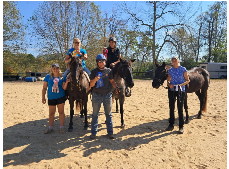
The usual suspects hauling in all the ribbons