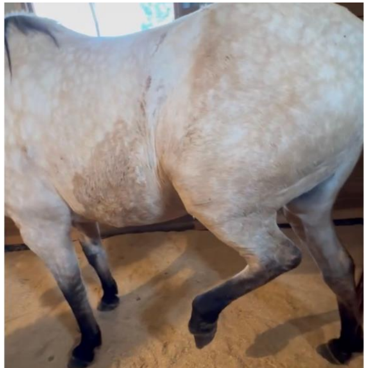
Maverick's sensitivity on the left hind foot

Fast forward to this past November. One day, he started showing sensitivity on his left hind foot. I thought an abscess was brewing, so, of course, I started soaking it. Nothing! I asked my farrier to check him out, and he found no sign of an abscess. In the meantime, it got to a point where Maverick wouldn't bear weight on that leg. So, I asked my vet to check him out. Again, after making some tests to try to find an abscess, still nothing!