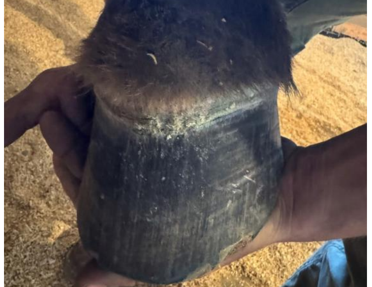
Determining Maverick's ailment was difficult

ing his leg wrapped and dry until the canker was all gone. This lasted a month, but it was well worth it. Maverick is so happy now and has become very loving and obedient again.